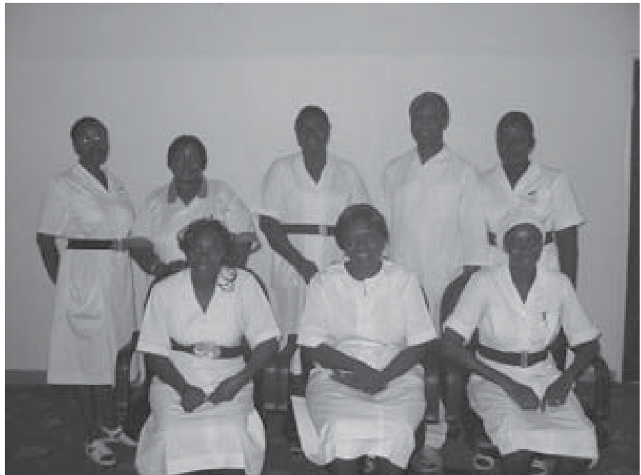
Some of the Department Matrons

The Chief Medical Director said, "The hospital has really come on in leaps and bounds since the departmental matrons were put in place. I am very encouraged by the progress which has been made".