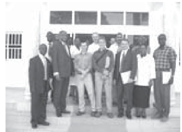
MRC visitors and RVTH Senior Management outside the new Paediatrics Building