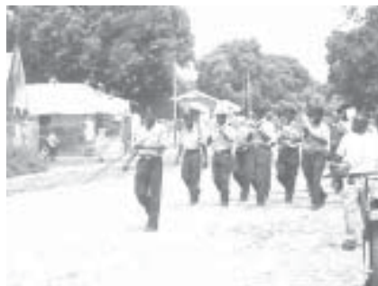
Banjul Police Band marching in Kerewan

Many RVTH Departments are active in supporting disability programmes and community health education programmes ranging from country wide psychiatric care, through stress management and malaria advice to eye care.